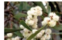
Acacia melanoxylon - Blackwood

These plants should be avoided in the Building Protection Zone. They should not be allowed dominate your garden and should be well maintained, being especially careful to remove dead material before it accumulates.