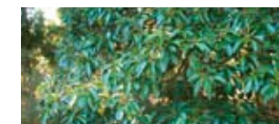
Hymenosporum flavum - Native Frangipanni

These plants are acceptable in the Building Protection Zone and will be valuable replacements for more flammable plants.