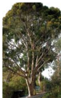
Corymbia maculata - Spotted Gum

In the following list E denotes an exotic plant, TN a plant native to Tasmania, AN a plant native to mainland Australia and X a known environmental weed.